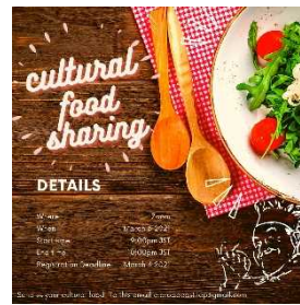
Cultural Food Sharing