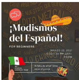
Mexican culture event