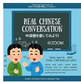
Chinese Talk Cafe