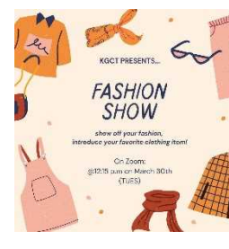
Digital Fashion Show